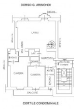
PIANTA PIANO QUINTO SOTTOTETTO (6 f.l.) Hmin = 0,50 m Hmax = 2,70 m