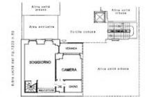
PIANO TERRA 1222 mq