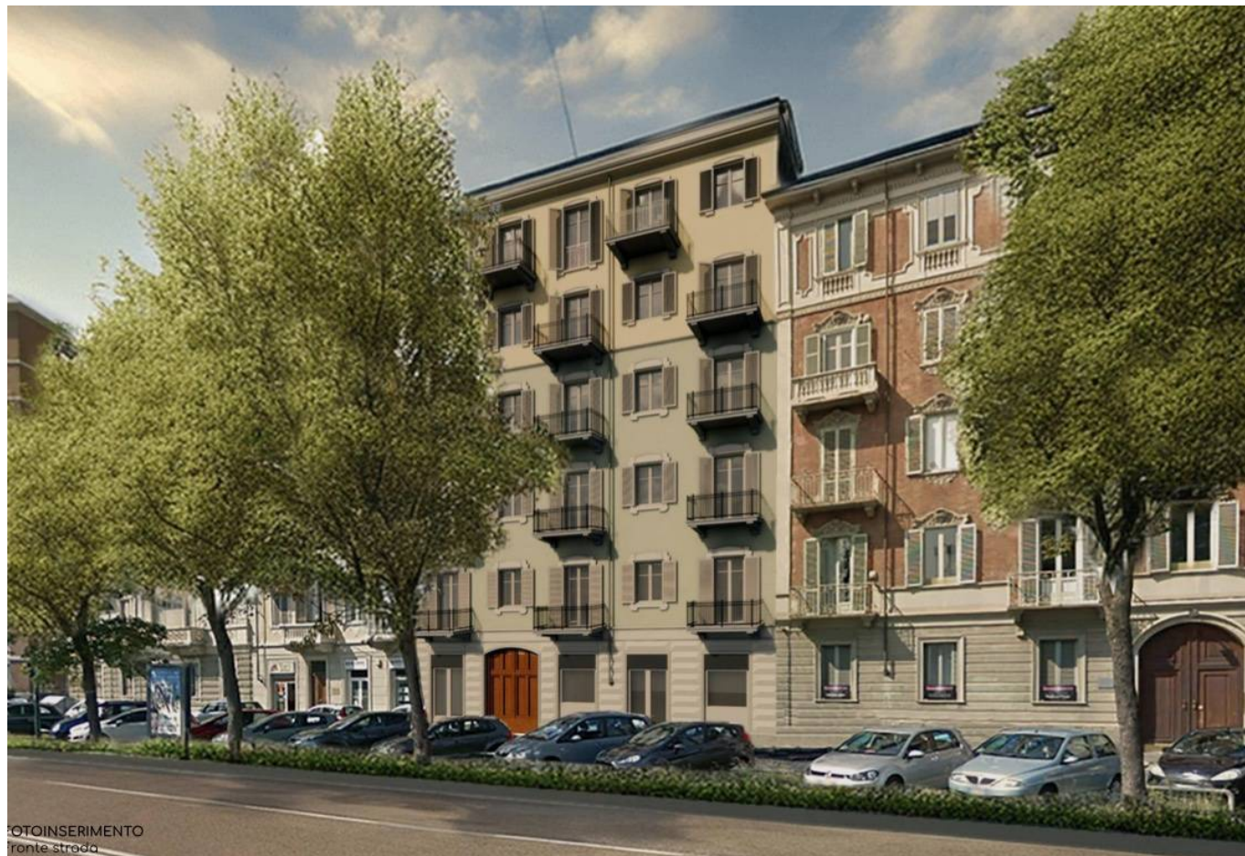
FOTOINserimento fronte strada